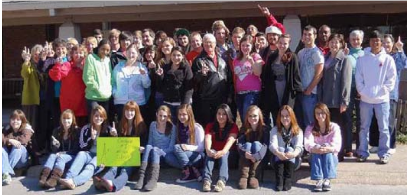
Collegiate High School students and staff gather to informally celebrate the announcement that the school ranked tops in Florida.

For information see the school's website at www.nwfcollegiatehigh.org or contact the school at (850) 729-4949.