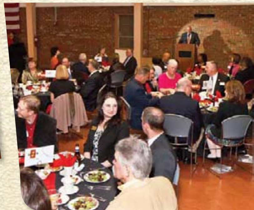
Annual Foundation Dinner