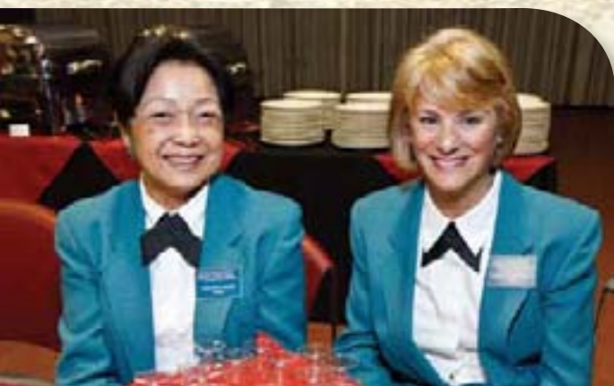
The Mattie Kelly Arts Center Ushers, AmericCorps/NWFSC and college Auxiliary Services staff provided valued assistance with the annual meeting event.