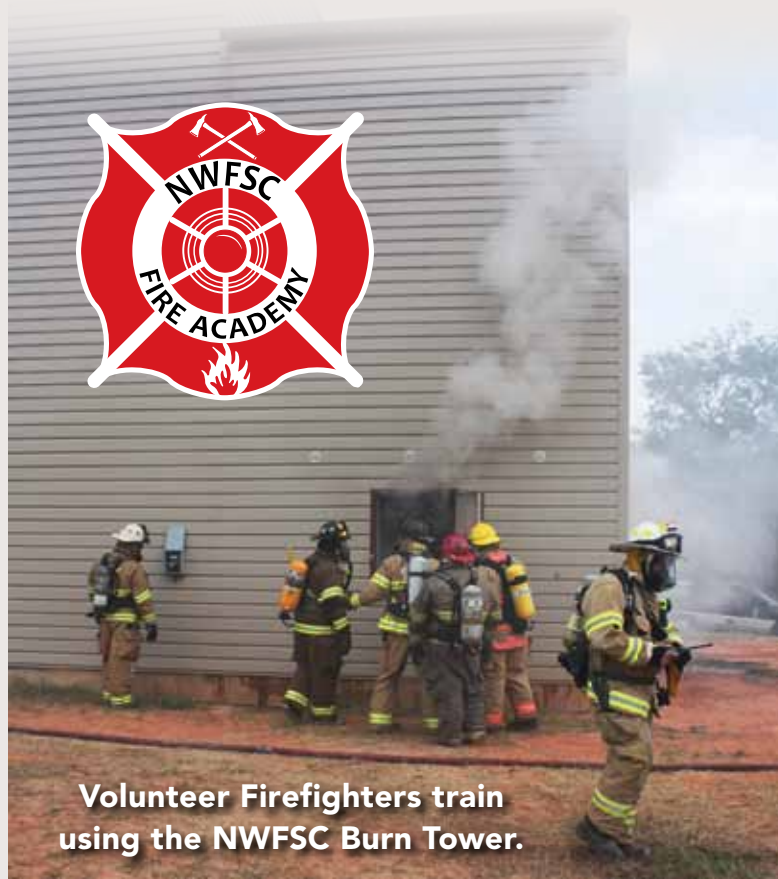
Volunteer Firefighters train using the NWFSC Burn Tower.