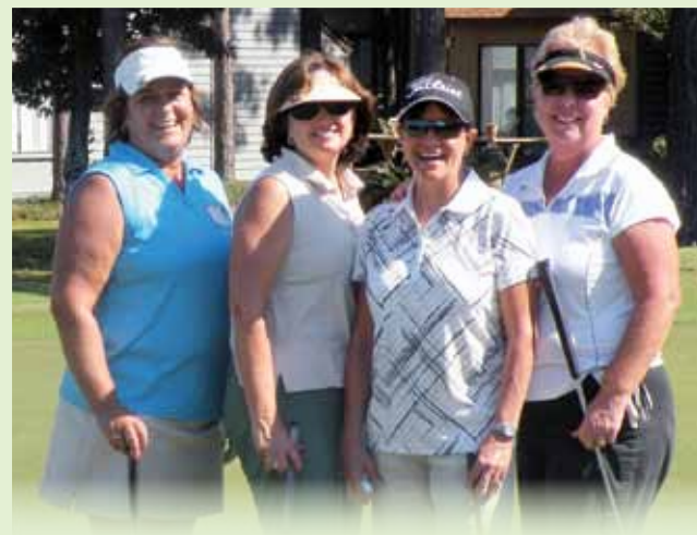
Tournament Winners Certified Construction Services, Inc.